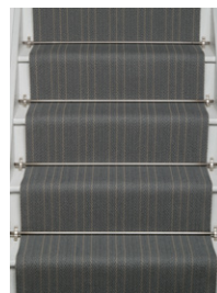
Byron French Grey