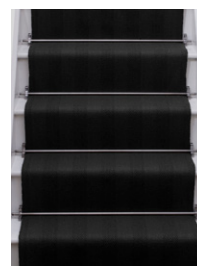
New Hadley Soft Black