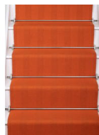
New Hadley Mandarin