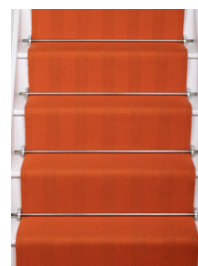
New Hadley Mandarin