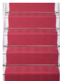
New Hadley Bright Rose