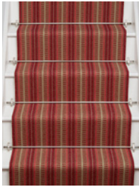
Vernon Soft Red